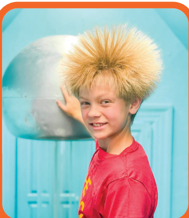
Make your hair stand on end at the Electrostatic Generator