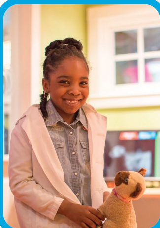
Take on the role of a veterinarian or mechanic in a child-sized village