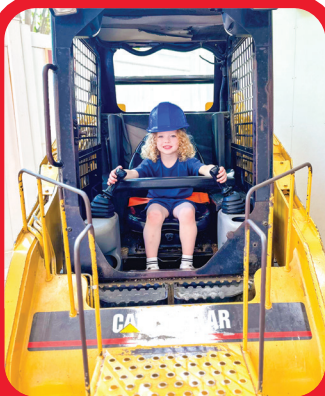
Dig in the Construction Zone