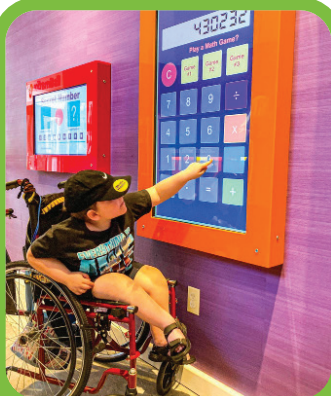
Problem solve in the Math Path